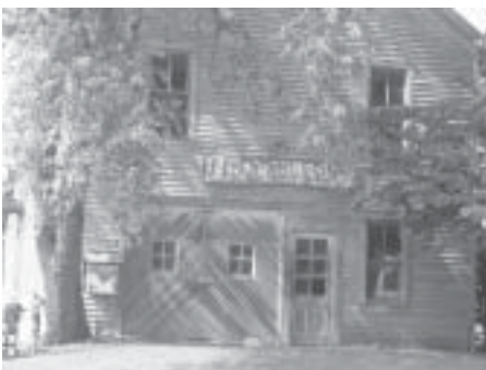
The faded word “Blacksmith” on the sign above signals the urgent need for restoration.