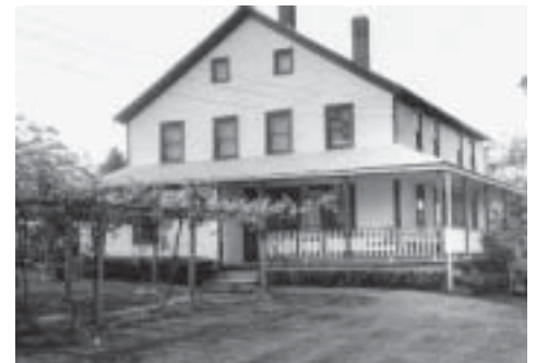
The Leah Lehman house will be a beautiful part of Sonnenberg Village.

This project will not outgrow the endowment fund's ability to maintain the basic expenses of the Village project. Also, this project will in no way take the place of the Kidron-Sonnenberg Heritage Center. It will continue to function as it has for the past 13 years.