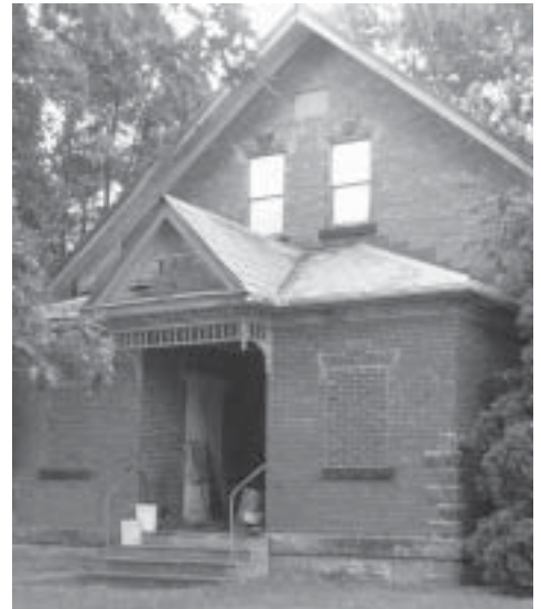
Sonnenberg School is one of several buildings that will become part of the new Sonnenberg Village.

A workable plan exists for the first buildings to be moved in June, 2008.