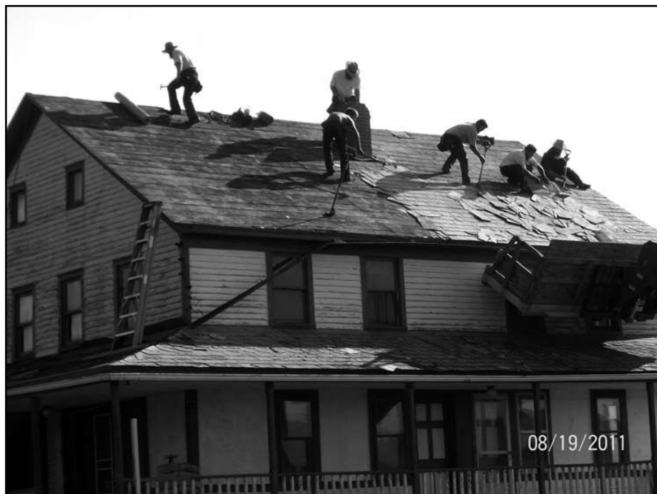
Roofing crews replaced the roof of the Lehman House in August.