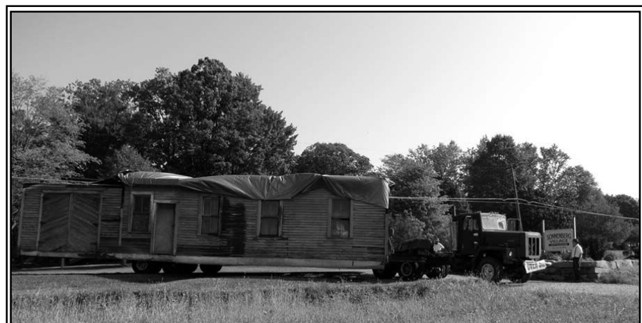
The Saurer Blacksmith Shop enters Sonnenberg Village, completing the move from its original location on Emerson Road, east of the square in Kidron.

With the security of a new roof, we would like to start work on the interior to prepare it for full restoration. If you have any interest and time this winter, we could sure use your help to remove wall paper, floor coverings and paint. Please call the center with your name and times that you can volunteer.