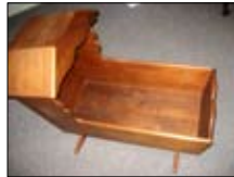
Walnut hooded cradle made by Joe Wolf