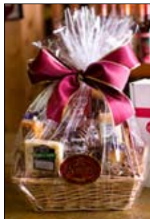
Shisler's Cheese House gift basket