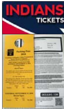
Four (4) Indians tickets w/parking pass. Sat, Sept 15, 1:05 pm vs Detroit Tigers, Sec 159, Row R, Seats 1-4, 10 rows behind Indians on-deck circle