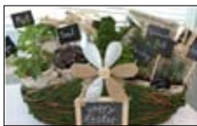
Karen's Garden Delights gift basket