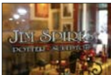
Jim Spires pottery