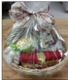
Quince Bakery and Café gift basket