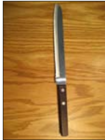
Kidron Swiss Cheese Factory knife