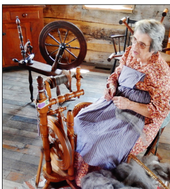
The week ended with a community worship and communion service at the Kidron Mennonite Church led by pastors from area Mennonite Churches.