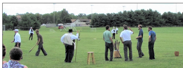
A vintage base ball game between the Smithville Stars and the Kidron Nine was played according to 1860 rules, The Kidron Nine were gracious in their victory.