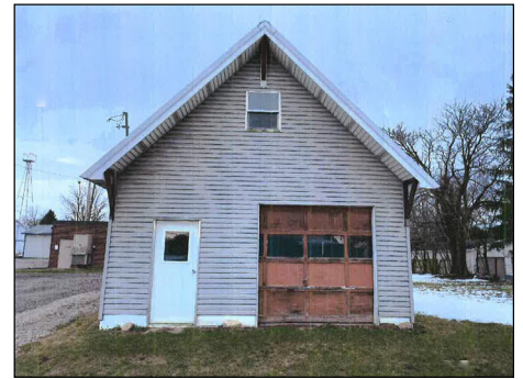
The Moser Buggy Shop has been dismantled and will be reconstructed in the Sonnenberg Village.