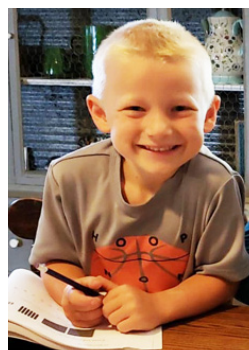
SEE NAMES P2