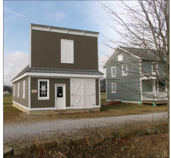
The Moser Buggy Shop, located next to the Bixler House, will house the Norr print shop equipment.

The Saurer Blacksmith Shop is complete and operational. Our resident blacksmiths hosted a "Hammer In" this fall for 40 fellow blacksmiths. They were impressed with the shop and the fact that blacksmithing as in times gone by is being properly preserved in a historical and functional shop.