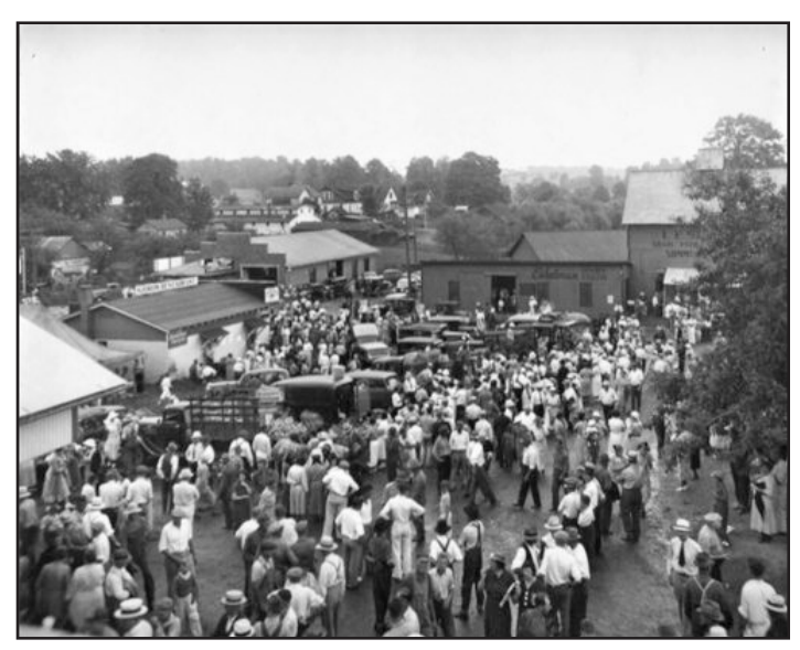
Buyers and sellers at the Kidron Auction in 1936.

"Seven-hundred and fifty? I have seven-hundred. Seven-fifty? Once, twice." The gavel bangs on the edge of the auction box. "Sold! $700. Next lot #87." So goes the chant at a typical sale on the Kidron Auction grounds, whether it be for livestock in the original auction ring in the barn, hay and straw, or estate and fundraising auctions in the comfortable Sprunger Building.