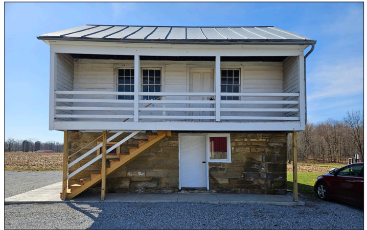
The Nussbaum Summer House is in place. Now we are looking for old summer kitchen utensils to display.

The KCHS has been awarded a $60,000.00 grant from the Wayne County Community Foundation. We are looking for approximately $60,000 in additional funds to complete this project, which will allow the barn to become more event-friendly.