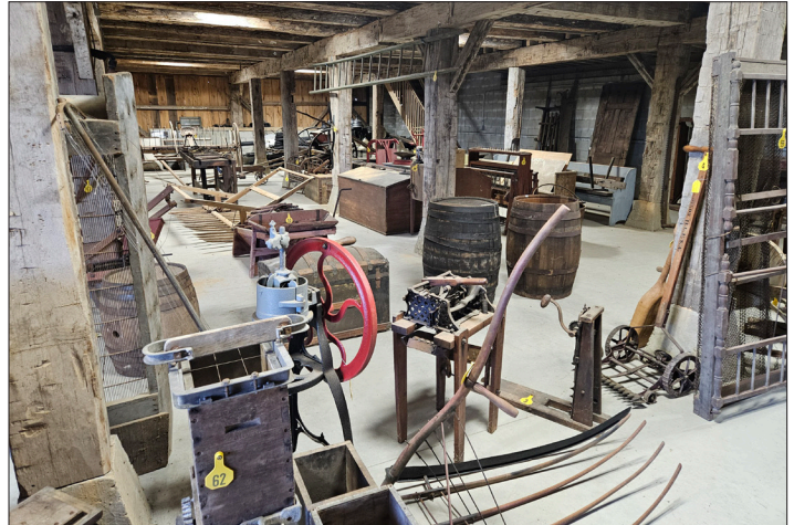
There is an extensive collection of agricultural-related items in the lower level of the Gerber-Nussbaum barn.